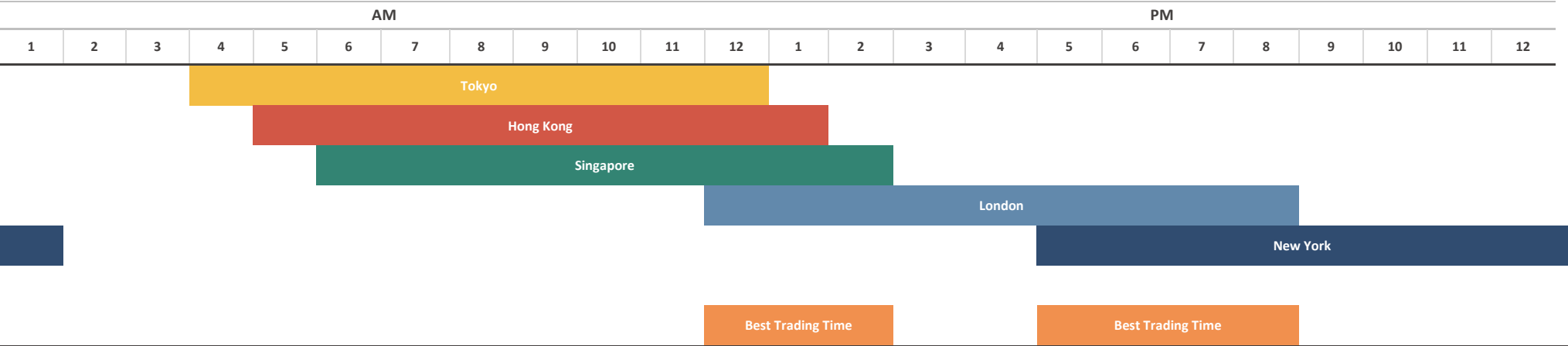
Forex Market Hours

Note: This chart shows the normal forex trading times of all the major forex trading centers across the globe in Pakistan Standard Time.